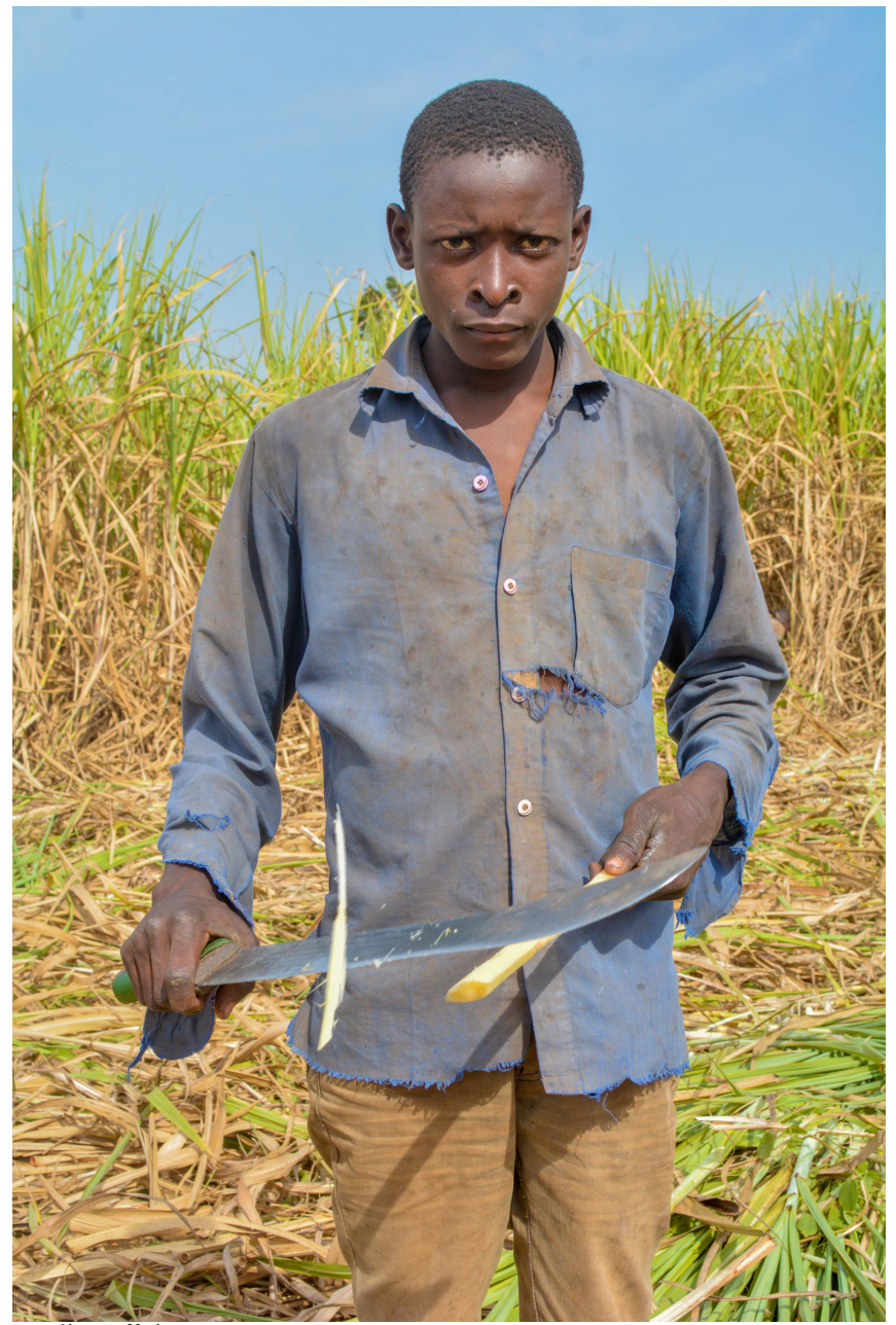
Feeding Affair A young boy prepares to eat a piece of sugarcane for his lunch

An elderly man takes a break from the sugarcane cutting