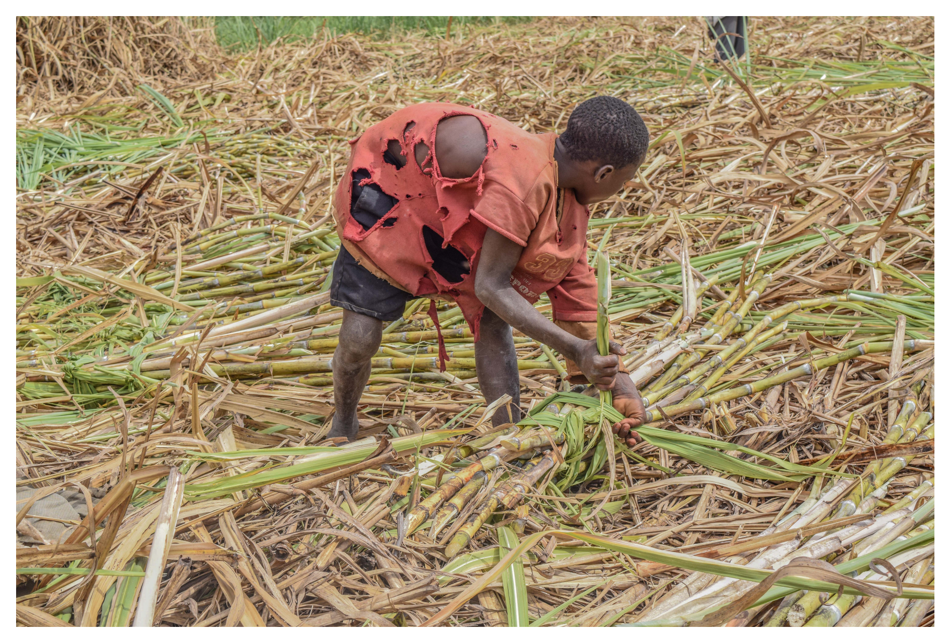
A young boy bundles sugarcane together for transportation to a sugar factory.