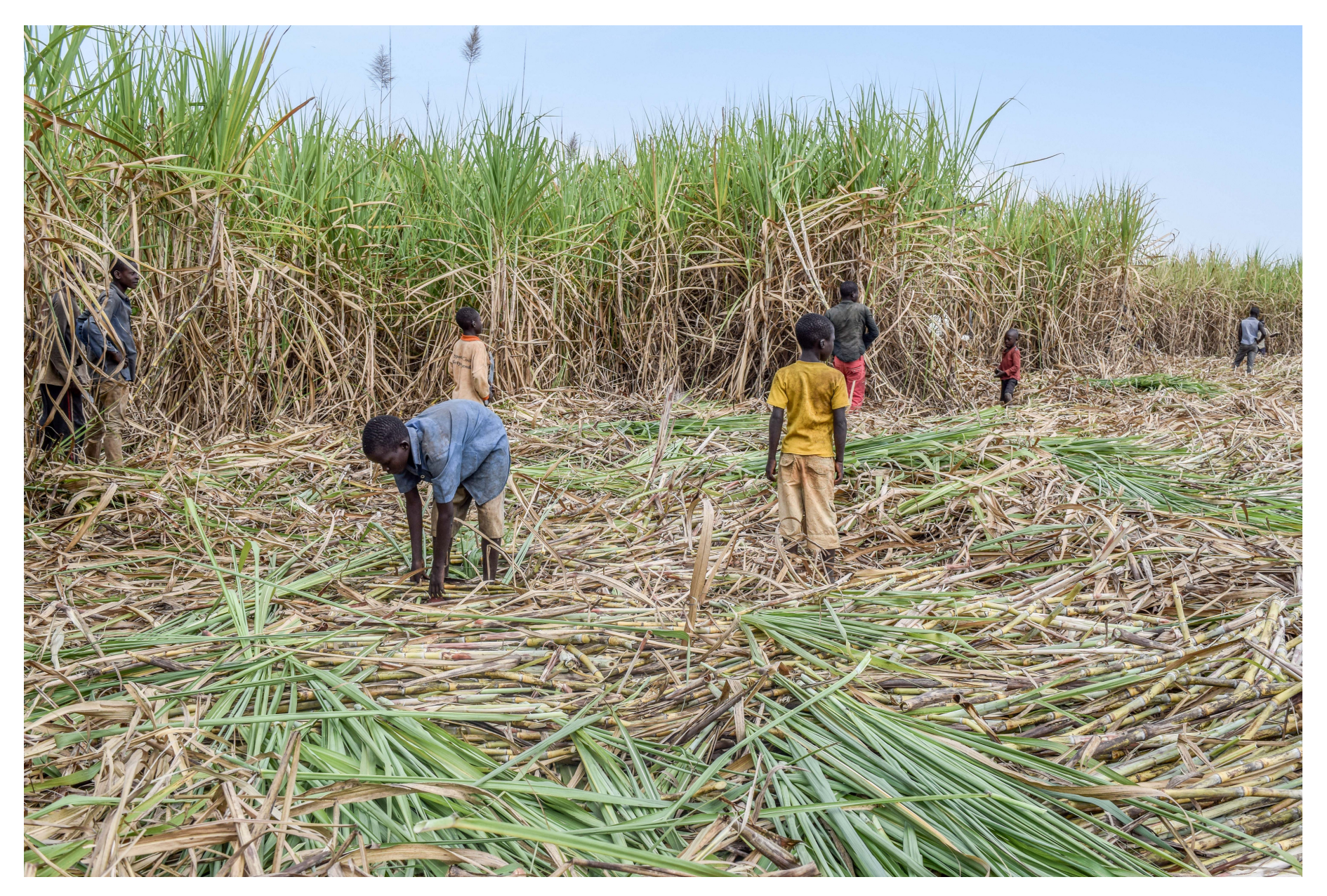
Children as young as 4 are used in the plantations to collect and bundle up the cut sugarcane and make it ready for transportation.