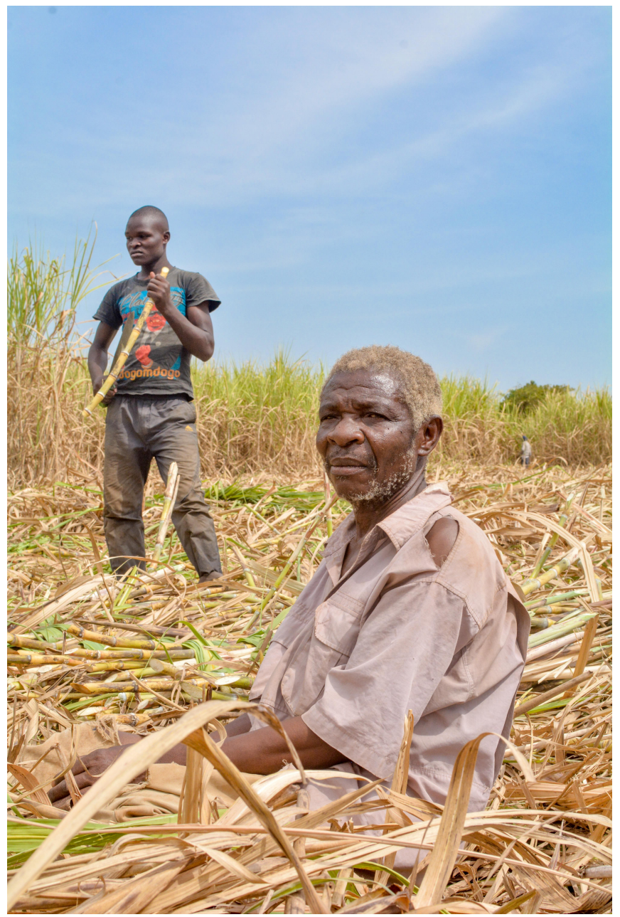
No Rest For The Weary

An elderly man takes a break from the sugarcane cutting